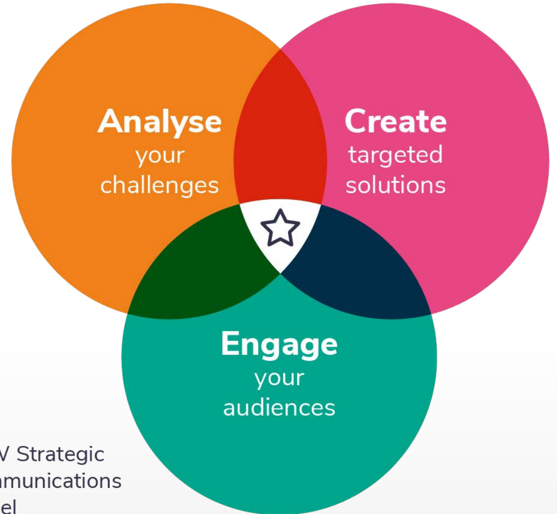
DTW Strategic Communications Model