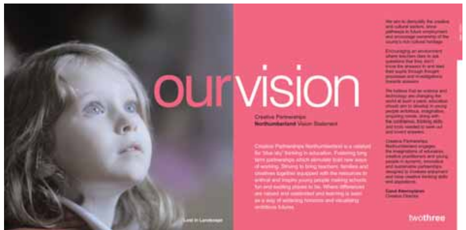
Welcome brochure cover and spread